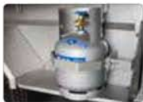
Gas cylinder holder. Cylinder is not included.

Quality Australian made all steel trailer