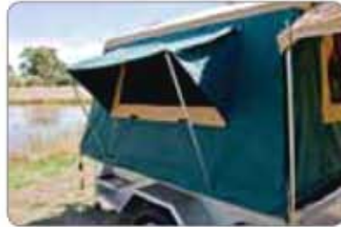
Weatherproof window awning