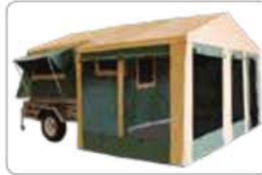
Fitted with optional sunroom wall kit