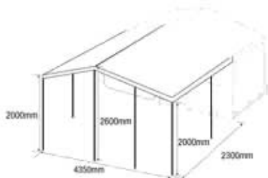
Dimensions for the 7' model

Freetime Camper Trailer is not available from our Carnegie, Moore Park, Logan & South Wharf Stores. Delivery of Freetime Camper trailer can take up to six weeks.