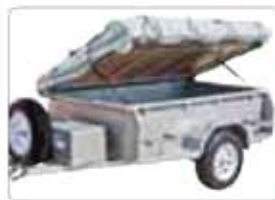
Gas struts for side opening