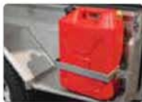
2 fuel / water jerry can holders. Jerry can is not included.