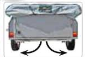
Wind down stabilizer legs