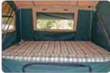
Queen size high density mattress